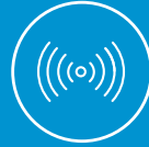
Free Common Area Wi-Fi