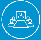
Conference/ Training Room