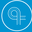
I-494 & Hwy. 100